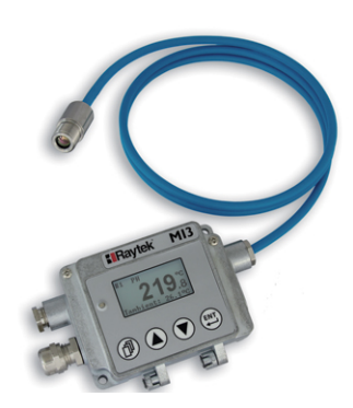
Raytek Compact Series MI3

The sensor head and mounting bracket do not require any special insulating material for mounting to the equipment structure. The sensor electronics may be mounted at up to 30 meters (98 feet) from the sensor head and outside the switchgear enclosure. Output signals are typically fed into a PLC or distributed computer control system for alarming and trending. Typically, six infrared sensors are used for busbar monitoring, three for input and three for output.