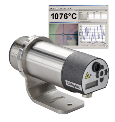
MM5G Sensor configurable via DataTemp Multidrop Software

For high ambient temperatures up to 175°C (350°F) the Air/Water-Cooled Housing would be required.