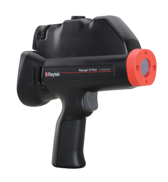
Raytek 3iPlus with Scope and Laser

The Onboard Data Logger allows storage of 100 tube temperature data points for downloading into a database for trend analysis.